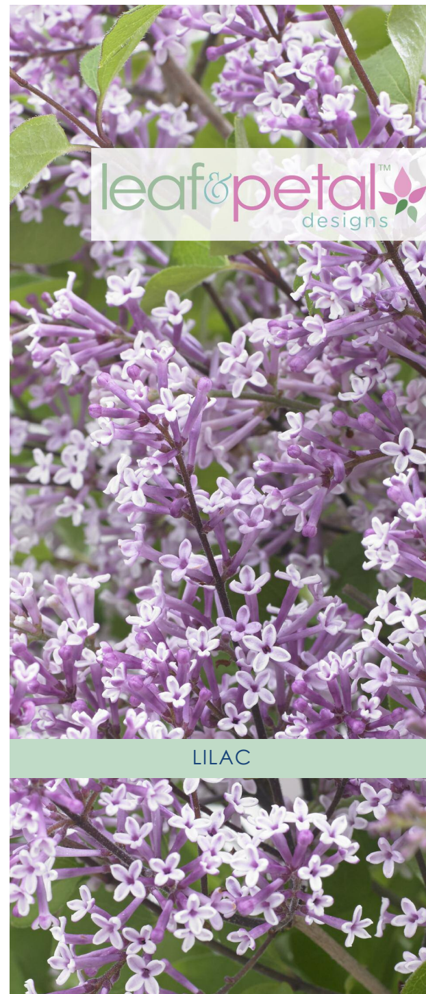
*Image on cover is representative of the type of plant(s) in this offer and not necessarily indicative of actual size or color for the included variety.

In case of ingestion contact a poison control center immediately. 1-800-222-1222